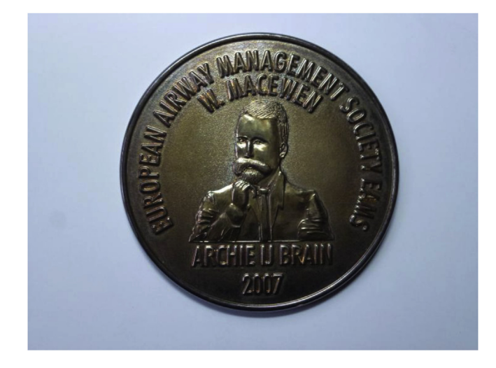
Fig. 4. One side of the Macewen/Kirstein medal.

What are the consequences of his scientific work concerning direct laryngoscopy?