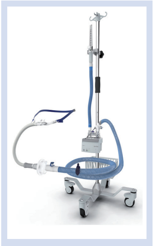
Fig 4 A humidified high flow nasal oxygen circuit by kind permission of Fisher and Paykel.

flow vortices generated by the high nasal flow and cardiopneumatic movements.