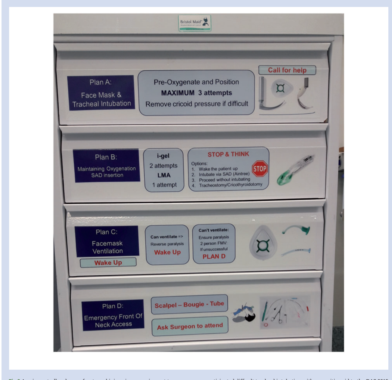
Fig 2 An airway trolley drawer-front combining airway equipment to manage an unanticipated difficult tracheal intubation with a cognitive aid to the DAS 2015 Guidelines.

100 cm H_2O into the stomach of cadavers in a steep Trendelenburg position and found that cricoid pressure prevented water from regurgitating into the pharynx. In a paralysed, anaesthetised patient with a latex tube filled with contrast placed in the oesophagus, he found the application of cricoid pressure led to a loss of contrast at the level of the applied pressure. He then went on to study cricoid pressure in patients considered at high risk for aspiration. In a series of 26 patients no regurgitation occurred in 23 before or after the application of cricoid pressure. In three patients he witnessed regurgitation after cricoid pressure was released after tracheal intubation.<sup>89</sup>