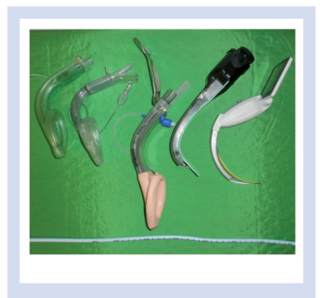
Fig 3 Airway devices described in the past 25 yr. From left to right (top row): Ambu AuraGain, LMA Supreme, Proseal LMA mounted on introducer tool, Airtraq, and McGrath MAC with X-blade. An Aintree (intubation) catheter is placed beneath them.

to the cricoid ring, providing an anatomical explanation for the occlusion he saw in his cadaveric experiments and in his series of 26 patients. However, a retrospective review of CT scans of healthy patients showed this not to be true; in 50% of subjects the oesophagus sits posterolateral to the cricoid ring, mainly on the left side.<sup>91</sup> Oesophageal position was also investigated using MRI imaging with and without cricoid pressure in 22 awake patients. It showed similar findings of posterolateral positioning of the oesophagus, mainly on the left side with an increase in the lateral displacement of the oesophagus from 53% to 91% with cricoid pressure.92 Ultrasound examination to assess the degree to which cricoid pressure compressed the oesophagus showed no reduction in the anteroposterior diameter of the oesophagus. However, a novel pressure site (paralaryngeal) did achieve the desired compression of the oesophagus.<sup>93</sup> Our traditional understanding of the anatomical position of the oesophagus may be incomplete and 'occlusion of the upper oesophagus by backwards pressure on the cricoid ring against the bodies of the cervical vertebrae'90 may be suboptimal or mistaken.